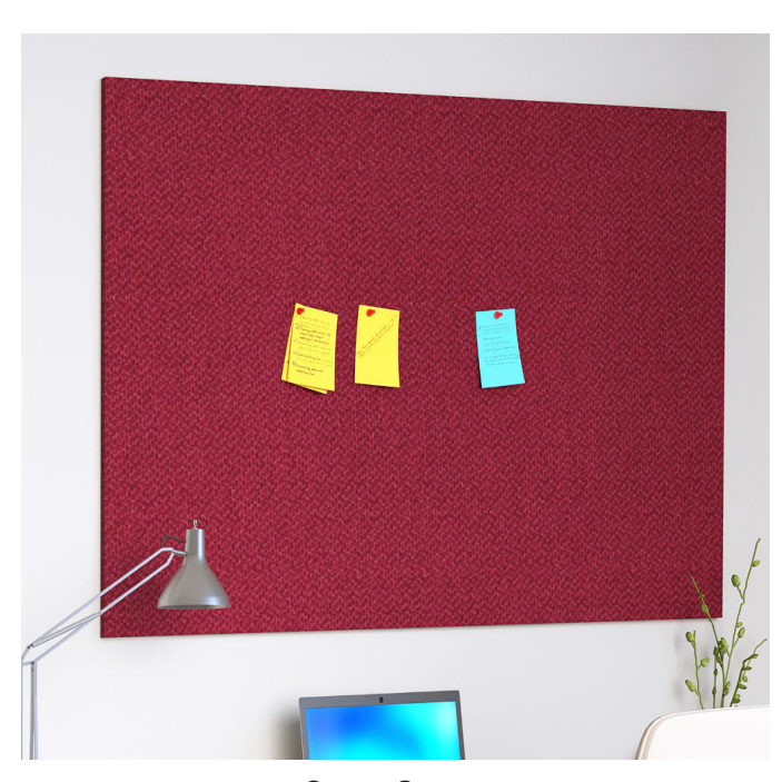
Square Corners (TBS)