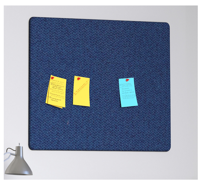
Radius Corners (TBR)

Re|Position, communicate, and create with MergeWorks Wall Mounted Fabric Tackboards. Ideal for individual use or as a communication board, Wall Mounted Fabric Tackboards enhance the look of your space while adding an effective information tool. Available with square or rounded corners.