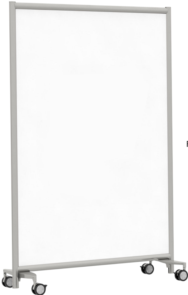
Charter™ Full Panel Dual-Sided Dry Erase Board

Engineered to be lightweight, durable and mobile, our TruBrite™ Whiteboards are designed and built to share ideas. Our high-quality TruBrite™ dry-erase writing surface is non-ghosting, easy to clean and economical. Available with silver or black frame and in 2 design options.