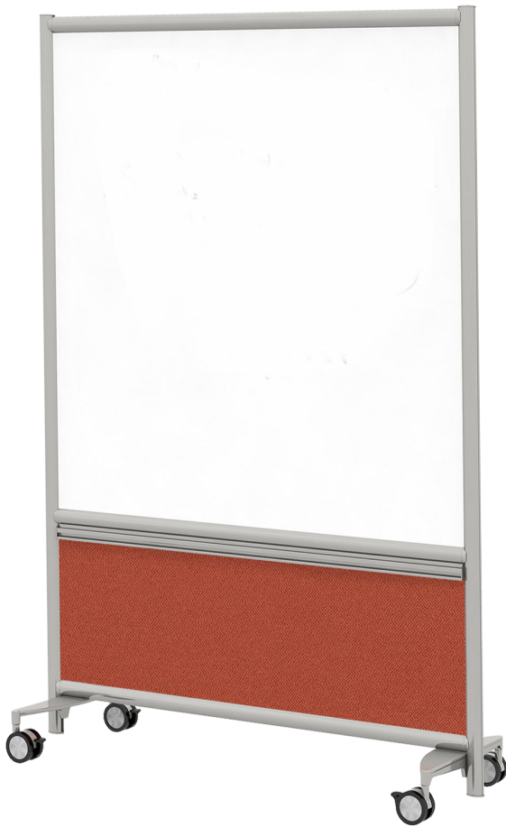
Annex™ Dual-Sided Dry Erase Board and Lower Customized Panel with Slatwall Accessory Rail