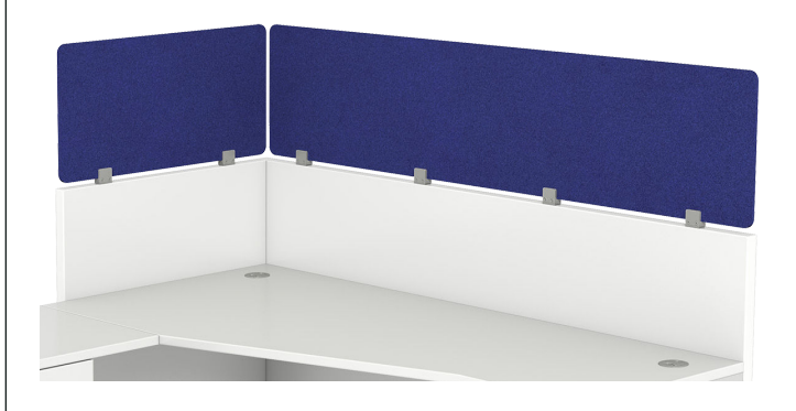
Stackers Panel (STK)