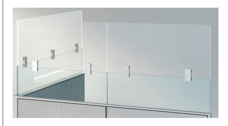
Stackers Flush Mount Panel for Glass Workstations (STGS)