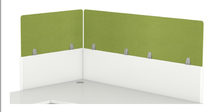
Stackers Flush Mount Panel with Radius Corners (STKN)