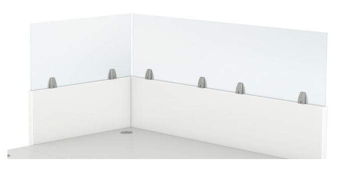
Stackers Flush Mount Panel with Square Corners (STKNS)