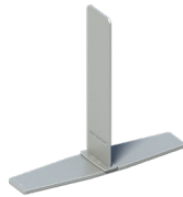
Invisible Free Standing