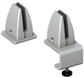
Middle Clamp Knob