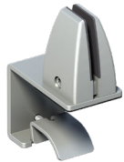
Middle Clamp Double