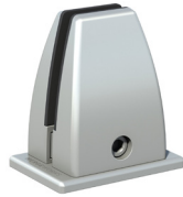
Tower Adhesive Mount