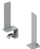
Invisible Middle Clamp