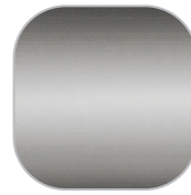
Satin Aluminum AA