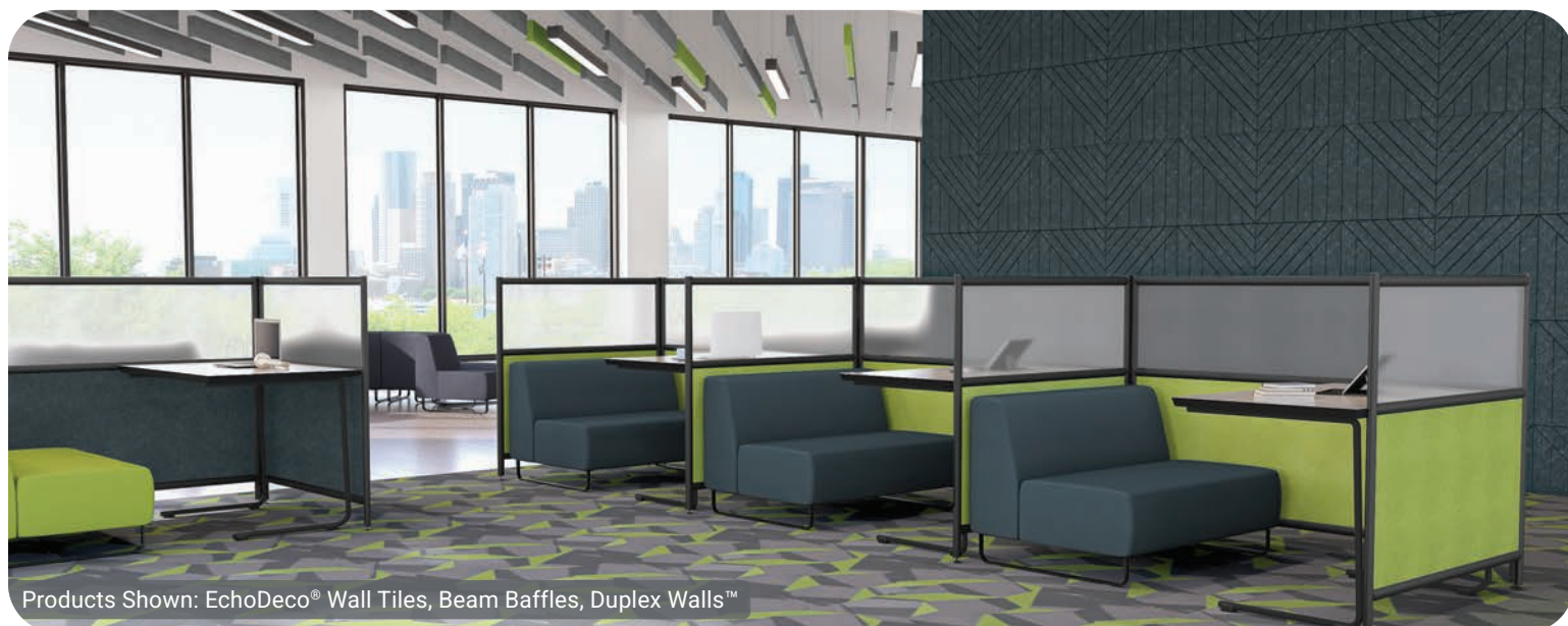
Products Shown: EchoDeco® Wall Tiles, Beam Baffles, Duplex Walls™

Whether retrofitting or building a new campus, our solutions install quickly and adapt with minimal disruption. MergeWorks products seamlessly merge with your education environment functionally, visually, and acoustically.