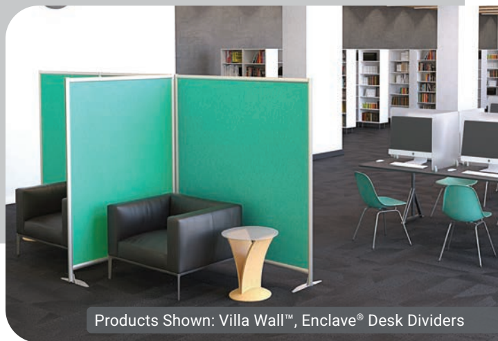
Products Shown: Villa Wall™, Enclave® Desk Dividers