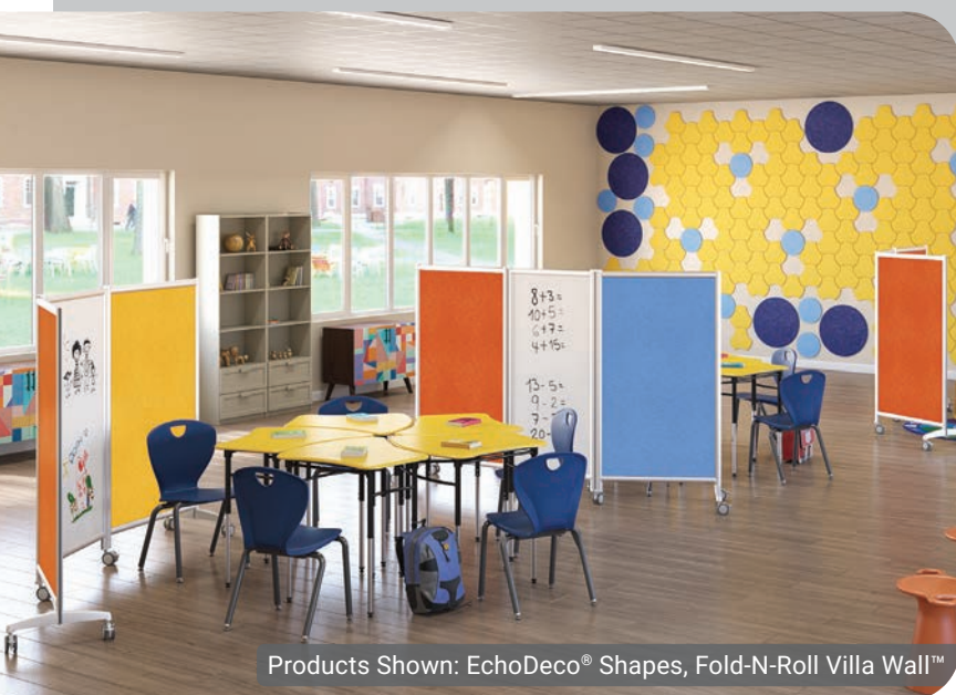
Products Shown: EchoDeco® Shapes, Fold-N-Roll Villa Wall™