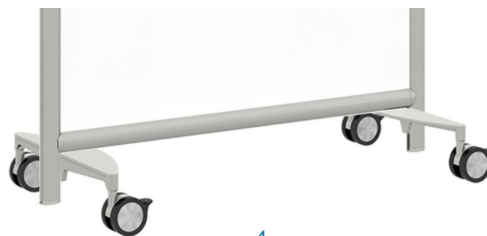
4 4 Wheels