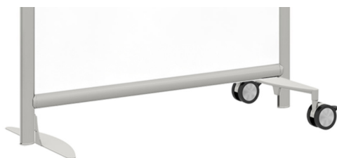
2WF 2 Wheels-1 Foot