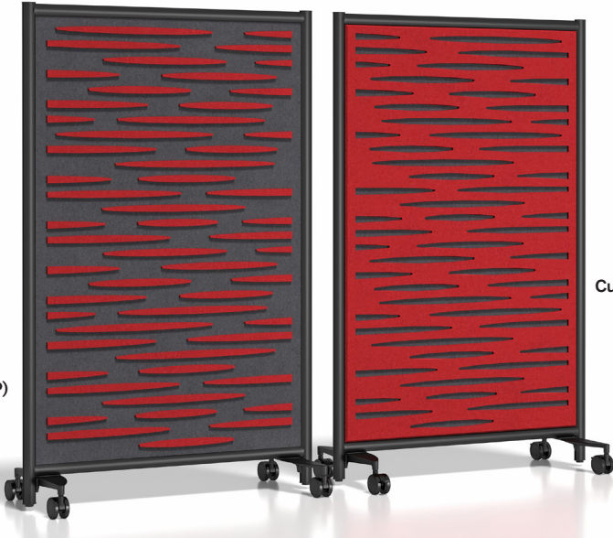
Cut-In Design Finish (C)