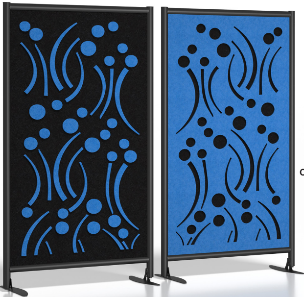
Cut-In Design Finish (C)