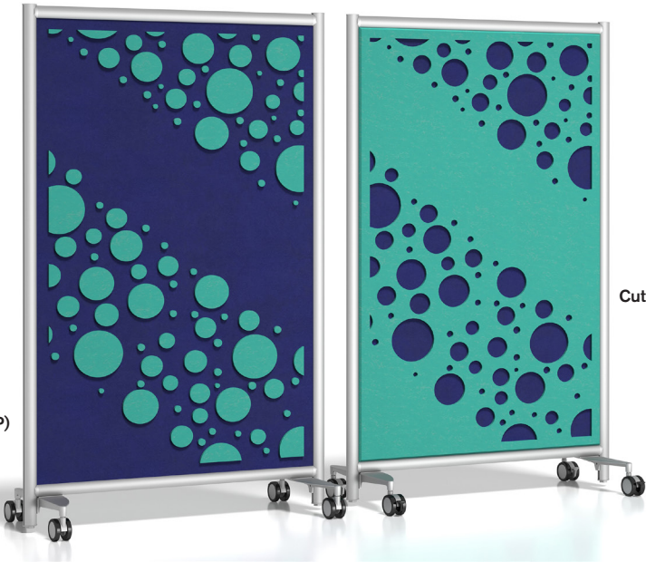
Cut-In Design Finish (C)