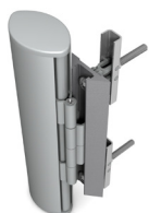
HGEW Wall Mount Hinge Kit