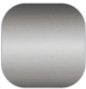
Satin Aluminum AA