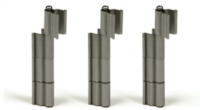
HGEUM Universal Hinge Kit Mobile Office Partitions