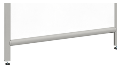
L 2 Levelers