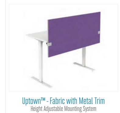
Desk Dividers • Above and Below the Desk