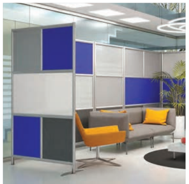
Urban Wall™ Panel Designs with Up To 6 Sections