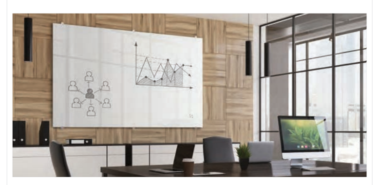
Wall Mounted Dry Erase Boards Magnetic Porcelain • Glass