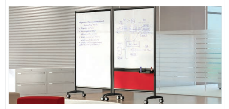
Mobile Dry Erase Boards TruBrite™ Whiteboards • Glass Boards • Magnetic Porcelain Whiteboards