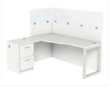
Cubicle Extender Panels • Stackers™