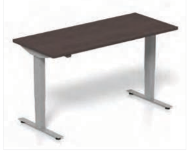
Electric Height Adjustable Tables 2 & 3-Stage Bases Available