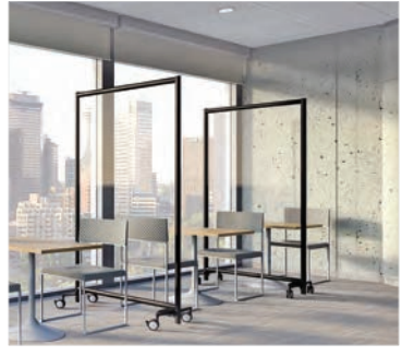
Villa Wall™ Single Material Core