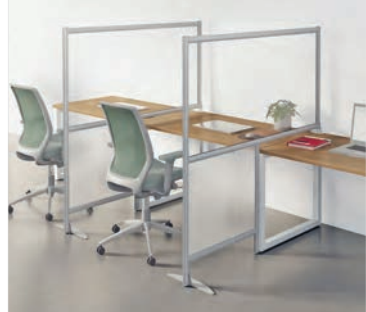
Notch Wall™ 2 Material Cores