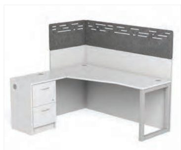
Stackers™ - Invisible Mount