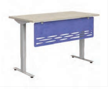
Modesty Panel - Acoustic EchoScape™