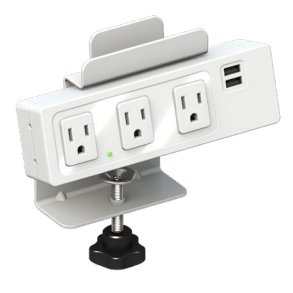
P32B-C PowerUP<sup>™</sup> Clamp-On Power Dock