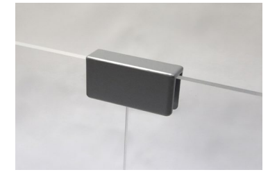
STK-CON-180-SV Straight Acrylic Panel Connectors