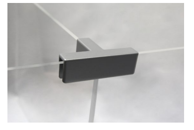
STK-CON-3WAY-SV 3-Way Acrylic Panel Connectors