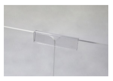
STK-CON-180-CL Clear Acrylic Straight Connectors