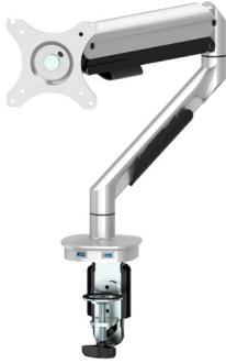
AC-SMAU-S VueLine™ - Single Arm Adjustable Monitor Mount