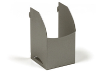
M-PTH Pencil Cup Frontage Series