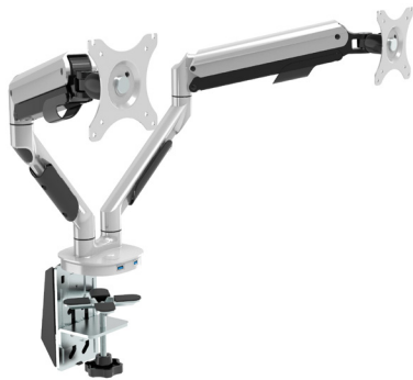
AC-DMAU-S VueLine™ - Dual Arm Adjustable Monitor Mount