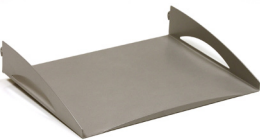
M-LTH Letter Tray Frontage Series