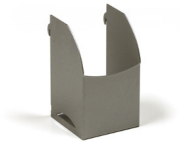
M-PTH Pencil Cup Frontage Series