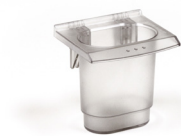
S-PC Pen Cup Rail Series