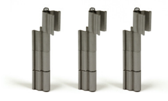
HGEUM Universal Hinge Kit Mobile Office Partitions