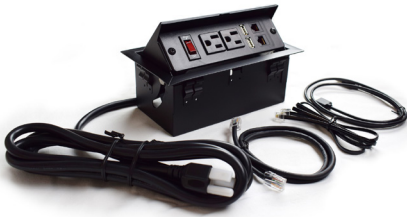
RP-JS-703 Pop-up Power & Data Station