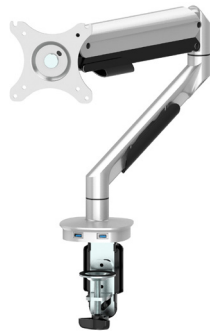
AC-SMAU-S VueLine™ - Single Arm Adjustable Monitor Mount