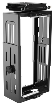
AC-CPU-B PV3 Adjustable Under Desk CPU Holder