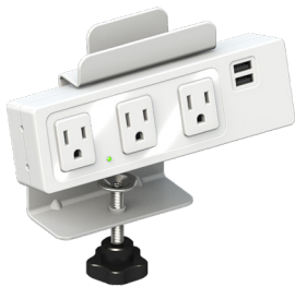
P32B-C PowerUP™ Clamp-On Power Dock